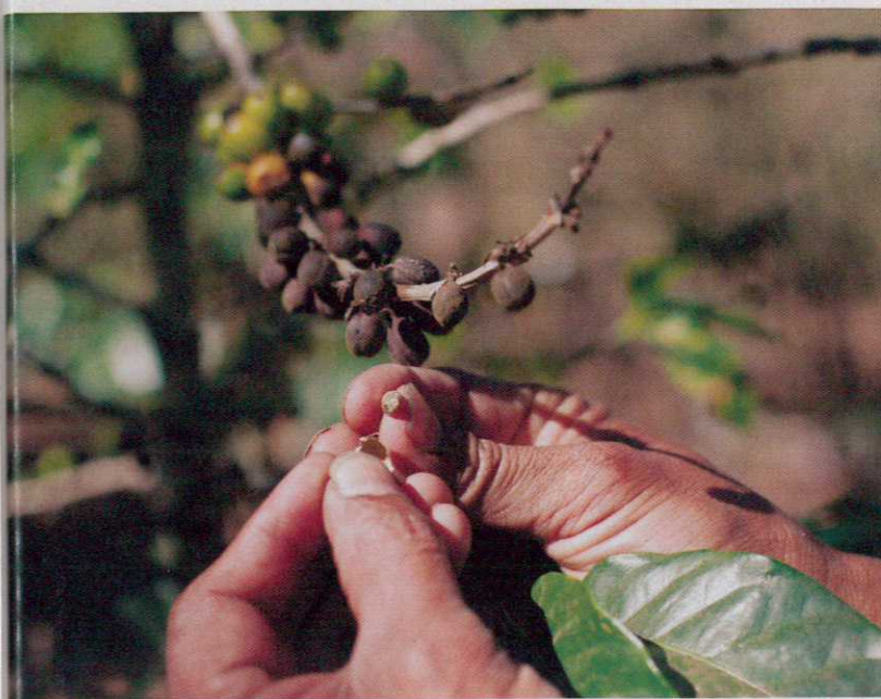
COFFEE RUST , a fungus, has damaged the beans of this coffee plant from Guatemala.